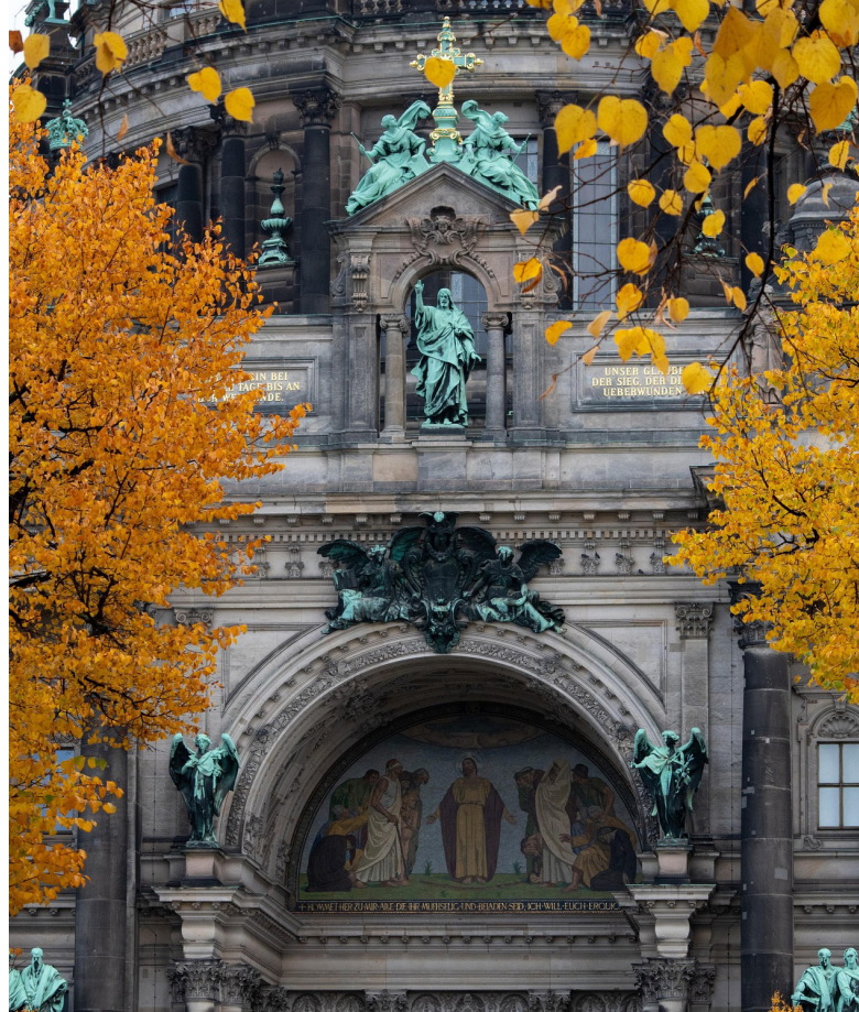
The Berlin Cathedral on the Museum Island in central Berlin.

The German health care system is among the best in the world. Your health insurance allows you to access all its services. You can find a list of hospitals in Berlin online .