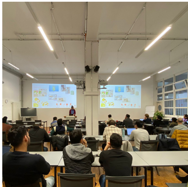
One of the lecture rooms at EUREF campus.

The computer pools at TU Berlin are open to all students and administered by TU Berlin's IT-Service-Center tubIT. Permission to use the computer rooms does not come automatically with your admission to study.