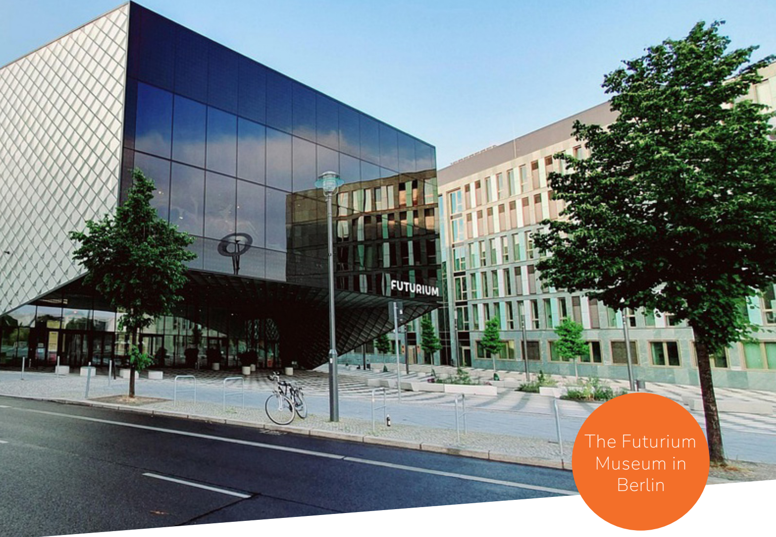
The Futurium Museum in Berlin

editing of papers, correcting master theses, research, programming models, building up infrastructure, networking, attending conferences and so forth.