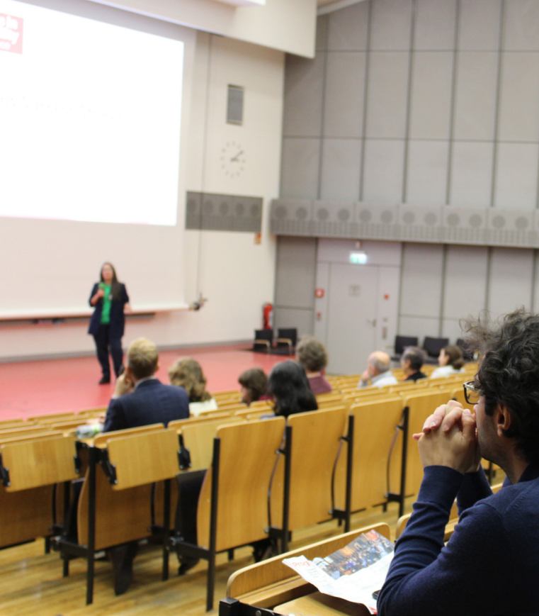
Impressions of the Energy Masters & Alumni conference - Challenges in Sustainability.

as lecture material, live online lectures in one virtual classroom per class, several “break-out sessions” serving as separate virtual rooms for group discussions and/or you would be working on projects individually or in groups. More methods of online learning would be added as is seen as didactically fit for your courses.