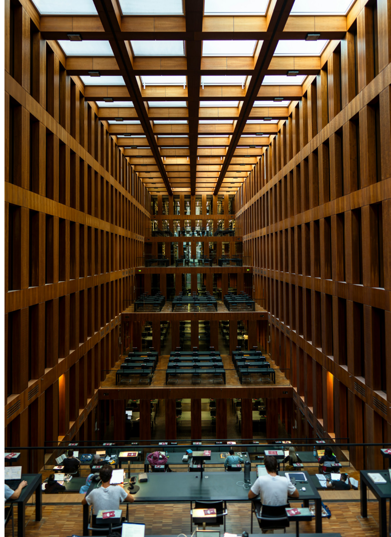
The university library Jacob-und-Wilhelm-Grimm-Zentrum is a popular study space - the terraces are, however, restricted to HU students at certain times.

Note that borrowing books is free – but not returning them in time can be costly. You can check the availability of workspaces before going to a TU or UdK library here .